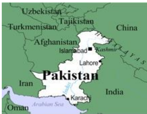
Figure 1: The strategic location of Pakistan

When the US embarked on its rhetorical war on terror demanded Pakistan to be its ally, it did not evaluate the strategic priorities and implications in the region. Pakistan was given the status of the front line state and a major non-NATO ally, Iran was declared an enemy and Iraq was the major threat. Hence Pakistan managed bagging the monopoly status in the region. The situation seemed quite appealing to General Musharraf at that time who wanted to seize every opportunity to rehabilitate its economy and legitimize his rule. Pakistan became the sole supplier of almost 84% of the material for the US-NATO forces in Afghanistan and ISI was the only agency providing information to the CIA regarding the terrorists’ hideouts in Afghanistan and its affiliates in Pakistan. Ever since the soviet invasion in 1979, Pakistan has had strong ties with the Taliban. Pakistan had always felt that it