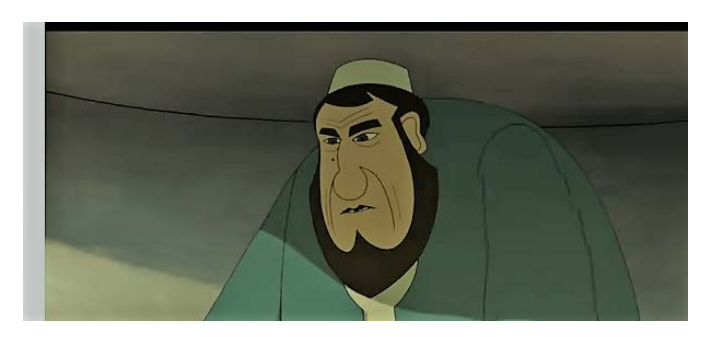
Figure 8: This picture is from the movie "The Breadwinner". (2017)This is to show the overgeneralized identity of Muslim men.