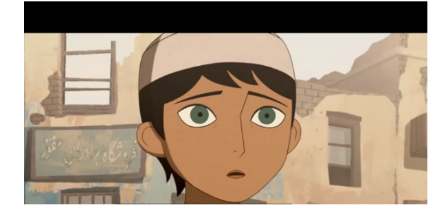
Figure 10: This is Parvana when she disguised herself in Aaatish and became acceptable in the society. (The Bread Winner, 2017).

Figure 9: This picture is of Parvana from the movie "The Bread Winner" (2017). The closed eyes of the protagonist shows that women are not expected to see things from their perception. They are meant to be suppressed.