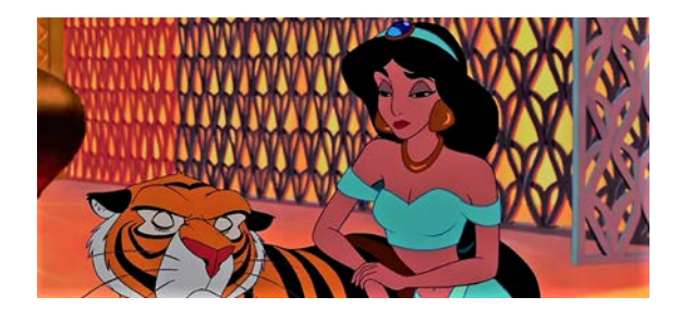
Figure 3: This picture symbolize that Jasmine is encaged in patriarchal setup. She is alone and has no human friend. She finds solace in the company of an animal. (Aladdin, 1992)

Figure 2: This picture from Aladdin (1992) symbolize that a white man is saving brown woman and a naïve brown child from a brown man. This again highlights the notion that white men are saviours whereas brown woman are under oppression. This picture also symbolize that even children are not saved from the tyranny of brown man.