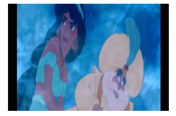
Figure 1: This picture is of King and his daughter "Jasmine" from the movie Aladdin. (1992) On one hand the white beard, fat body of the King and on the other hand the overly sexualized appearance of the Jasmine both contradicts the reality. The watery eyes of Jasmine shows her dissatisfaction with her life. These characters misrepresent the image of Muslims.

This is a policy employed by Western media, they Hijacked the real image of Islam and this to tactic give birth Islamophobia. Islamophobia means fear of Islam. The religion which promotes peace is crushed into pieces. Islam has given all the rights to men and women. Women are not inferior in the eyes of Almighty. Parvana's disguise, Sorrya's misères, Jasmine's isolation, Aisha's abduction are the images shown not only in the under discussed movies but also in other movies. Their veil/purdah is even considered a symbol of repression. The continuous watching of these movies will make one believe that the Arabs are all exactly like the characters presented in the movies. In almost all the on screen programs Arabs are depicted as rats, jackals, pigs and bastards.