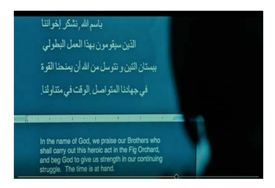
Figure 4: As shown in the movie, these pictures are basically email correspondence among terrorists and its starts with the name of God. They are asking strength from God before committing a heinous act. This put the