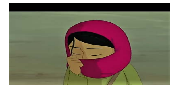
Figure 9: This picture is of Parvana from the movie "The Bread Winner" (2017). The closed eyes of the protagonist shows that women are not expected to see things from their perception. They are meant to be suppressed.