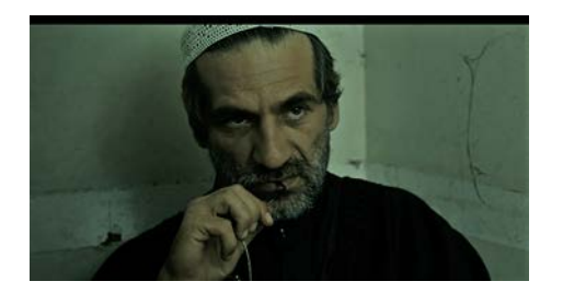
Figure 5: This man is shown as the head of all crimes, the master behind all the evils. His head is covered with cap, he has beard, in short he is intentionally portrayed in a way because usually Muslims have such looks. This makes all men suspicious. (Body of Lies, 2008).

followers of Islam and religion itself in question mark. Is this Islam preach? The Arabic language shows the involvement of Arabs in violent acts. (Body of lies, 2008