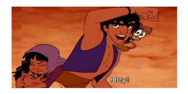
Figure 2: This picture from Aladdin (1992) symbolize that a white man is saving brown woman and a naïve brown child from a brown man. This again highlights the notion that white men are saviours whereas brown woman are under oppression. This picture also symbolize that even children are not saved from the tyranny of brown man.

Figure 1: This picture is of King and his daughter "Jasmine" from the movie Aladdin. (1992) On one hand the white beard, fat body of the King and on the other hand the overly sexualized appearance of the Jasmine both contradicts the reality. The watery eyes of Jasmine shows her dissatisfaction with her life. These characters misrepresent the image of Muslims.