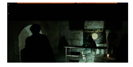
Figure 6: This picture is from the movie body of lies where the protagoinst is in the arrest of terrorists. The backdrop has the first Kalma of Muslims.this again provked the point that Mulsism are doing this under the shade of Islam. This again put the religion Islam and its followers in question zone. (Body of Lies,2008)

Figure 5: This man is shown as the head of all crimes, the master behind all the evils. His head is covered with cap, he has beard, in short he is intentionally portrayed in a way because usually Muslims have such looks. This makes all men suspicious. (Body of Lies, 2008).